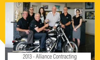
2013 - Alliance Contracting