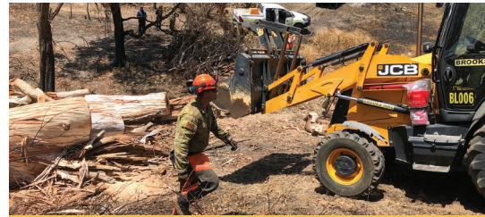
Adelaide Hills Bushfire Cleanup

We support many charity groups, voluntary organisations, community groups and sporting clubs at a grass roots level, fostering community spirit and engagement. From providing donations to lending our machinery, our involvement with the community stretches far and wide.