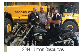
2014 - Urban Resources