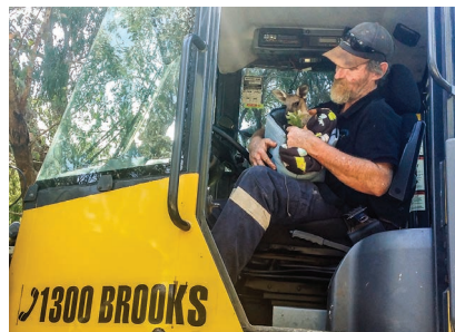
Mandurah Wildlife Rescue