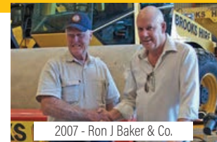
2007 - Ron J Baker & Co.