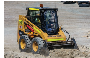
Skid Steer Loaders & Attachments