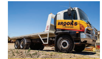
Freight Trucks & Trailers