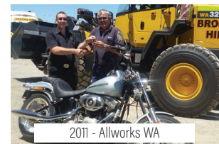
2011 - Allworks WA