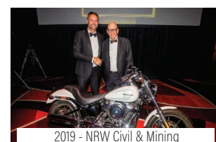
2019 - NRW Civil & Mining