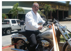
2004 - City of Fremantle