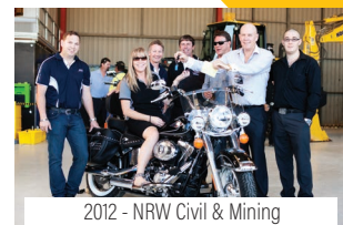
2012 - NRW Civil & Mining