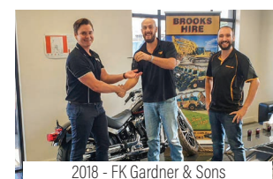
2018 - FK Gardner & Sons