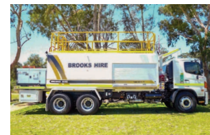
Fuel Trucks and Trailers