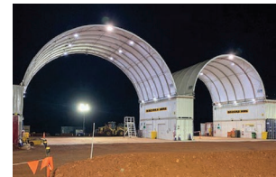
Portable Building Hire