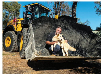
Kaarakin Conservation Centre