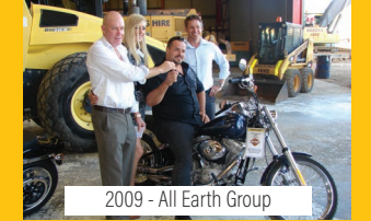
2009 - All Earth Group