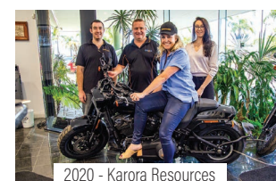
2020 - Karora Resources