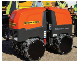
Remote Control Trench Rollers