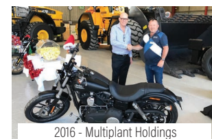
2016 - Multiplant Holdings