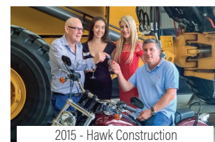
2015 - Hawk Construction