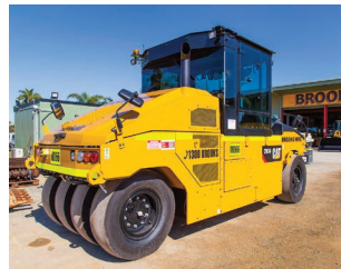
Multi Tyre Pneumatic Rollers