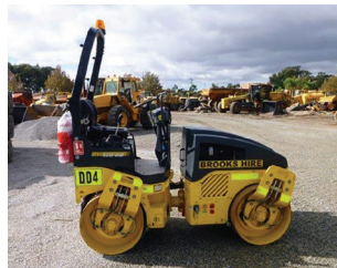
Double Drum Vibrating Rollers