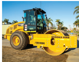
Smooth Drum Vibrating Rollers