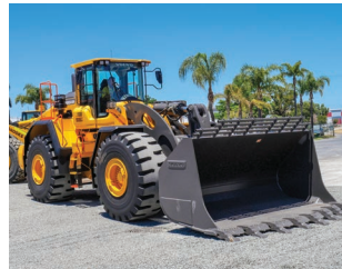
Wheel Loaders & Tool Carriers