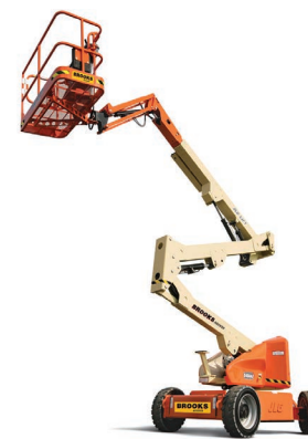
Knuckle / Articulated Booms