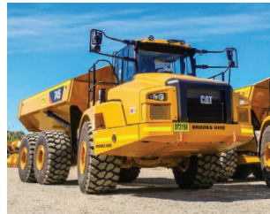
Artic. Dump Trucks