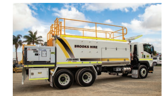
Service Trucks & Trailers