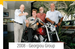
2008 - Georgiou Group