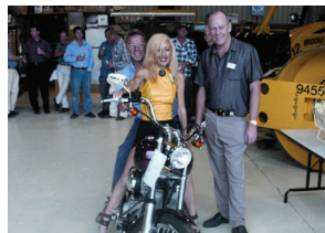
2003 - Complete Underground Power