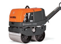
Double Drum Rollers