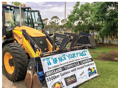
'It's NOT Your Fault 4 Kids'