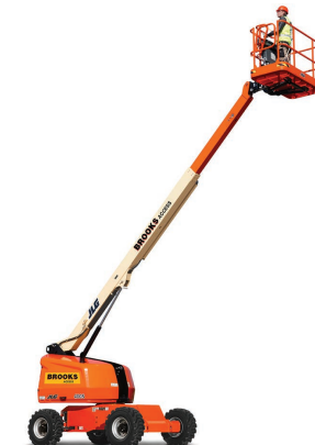
Straight / Telescopic Booms