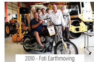
2010 - Foti Earthmoving