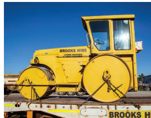
3 Pin Static Rollers