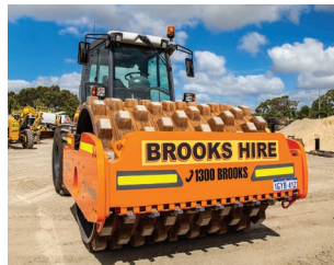
Padfoot Vibrating Rollers