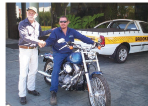
2005 - Shire of Victoria Plains