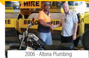
2006 - Altona Plumbing