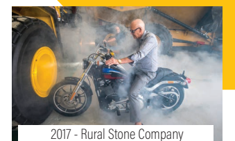
2017 - Rural Stone Company